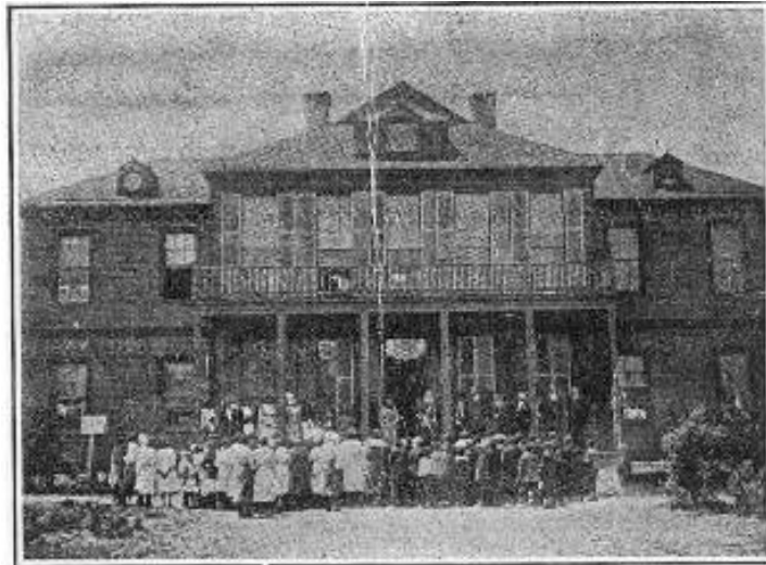
PEABODY STATE NORMAL INDUSTRIAL AND AGRICULTURAL SCHOOL, ALEXANDRIA, LOUISIANA.